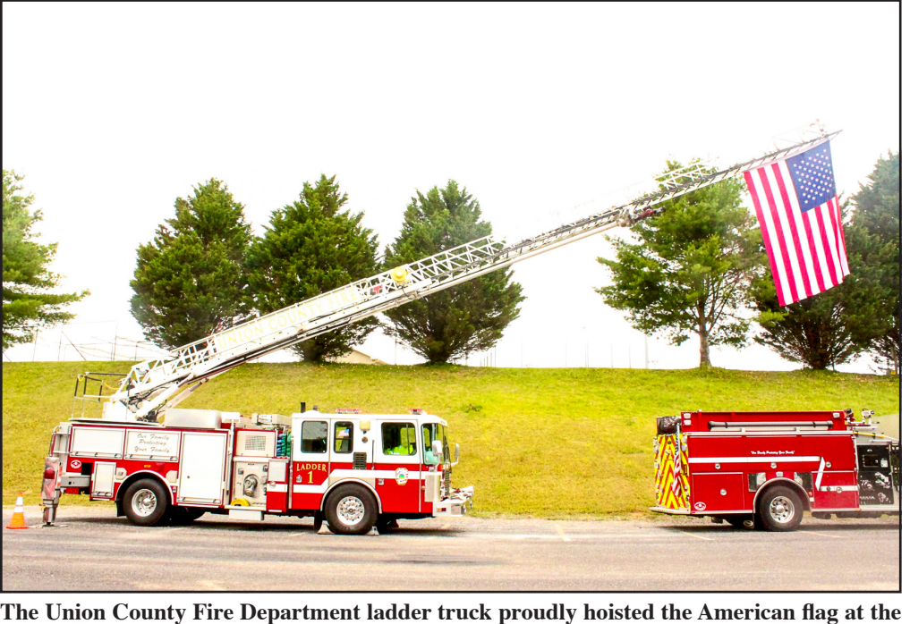
The Union County Fire Department ladder truck proudly hoisted the American flag at the June 14 Flag Day event in Meeks Park.

want to relate to: independence, good. We want to do good, be