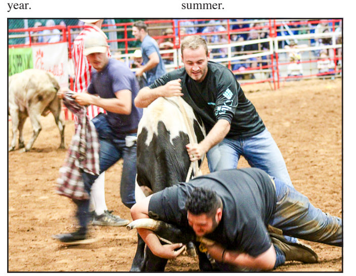
Steer dressing is a popular event that awards a cash prize for the first team to get a shirt, shorts and hat onto a steer.

not interested in other sports. Be sure to check out the Blairsville Pro Rodeo when it rides back into town next