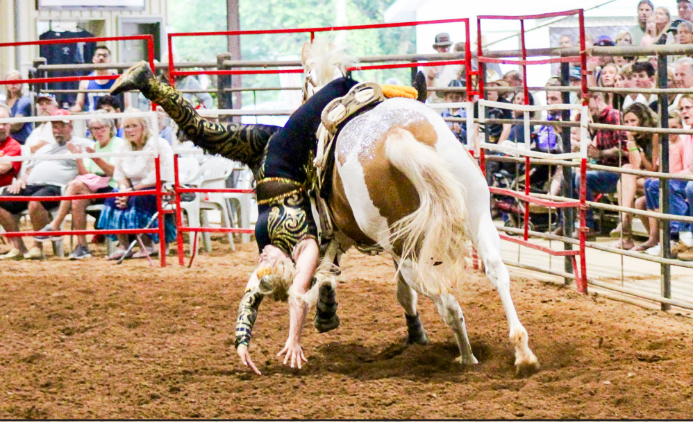
As usual, the Blairsville Pro Rodeo featured plenty of high-stakes riding, like this acrobatic stunt rider wowing crowds with her daring moves.

Steer Wrestling, Team Roping, Tie-Down Roping, Ladies Breakaway Roping, Cowgirl Barrel Racing and Bull Riding.