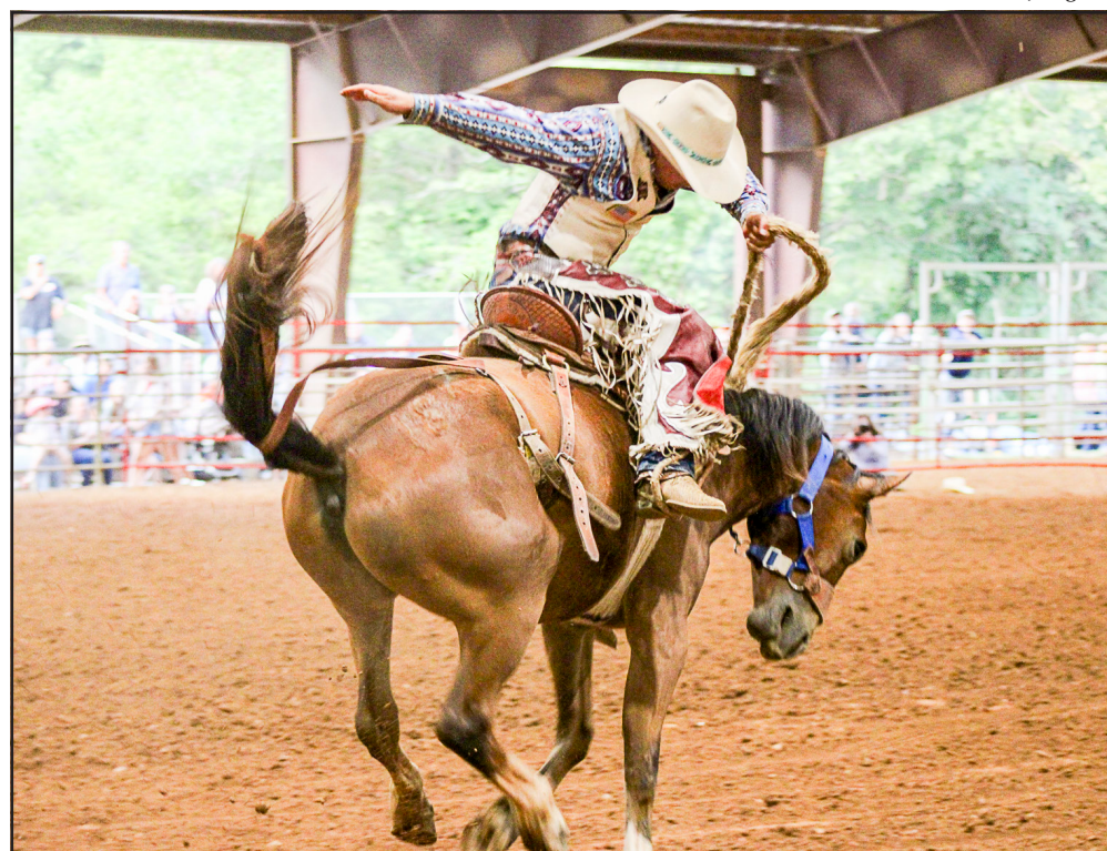
The Blairsville Pro Rodeo filled the stands at the Union County Arena Friday and Saturday for hours of intense rodeo action.

Competition included Bareback Bronc Riding, Saddleback Bronc Riding, See Blairsville Pro Rodeo, Page 6A